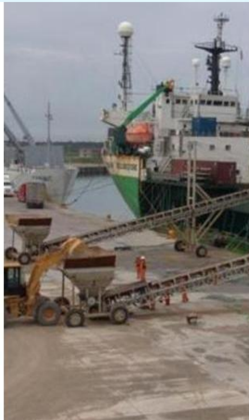
Stone Handling to Subsea Construction Projects.