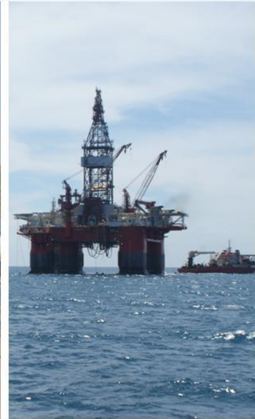
Logistic Support to Offshore Activities.