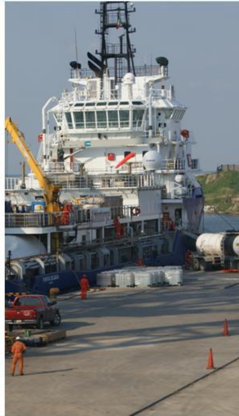
Nitrogen and Chemicals Supply.