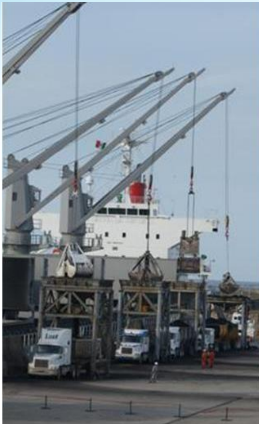
Mineral Bulk Cargo.